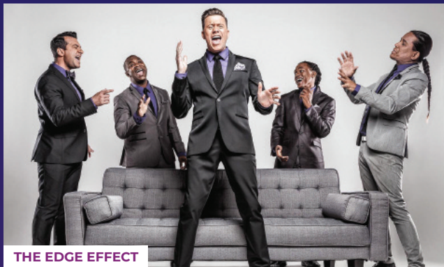
THE EDGE EFFECT