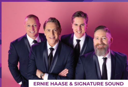
ERNIE HAASE & SIGNATURE SOUND