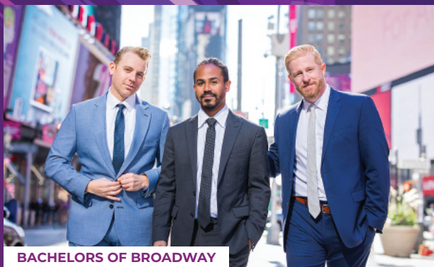
BACHELORS OF BROADWAY