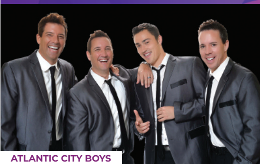
ATLANTIC CITY BOYS