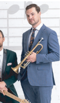
THE FOUR FRESHMEN

Although the names and faces have changed over the last 75 years, The Four Freshmen's harmony and legendary sound continue to fascinate audiences worldwide. Today's Four Freshmen ensemble consists of highly educated, musically diverse young men providing their own accompaniment, making them one of the greatest jazz vocal groups of all time.